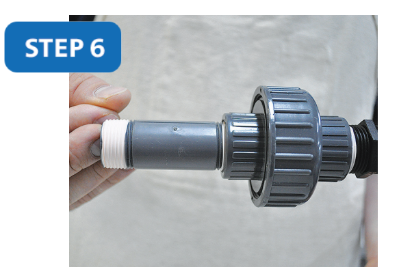
Attach the 3 " nipple to the union .