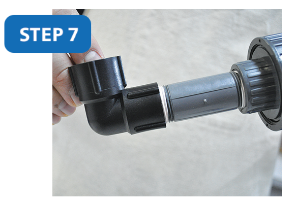
Connect the other 3/4 " female to female elbow to the 3 " nipple .

You have completed the inlet side assembly.