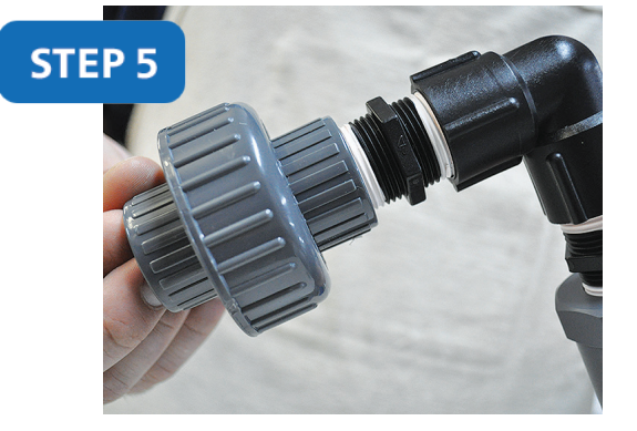
Attach one of the unions to the nipple .

Attach the other 2 " nipple to the other side of the elbow .