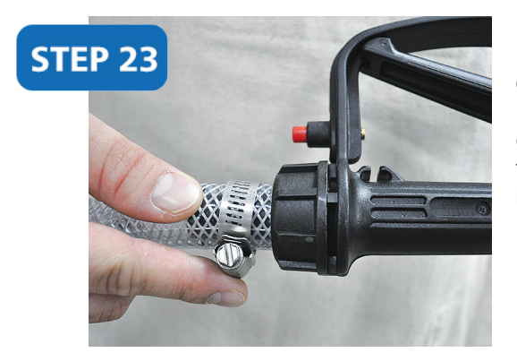
Place the hose clamp over the other end of the hose and attach to the gas style nozzle . Tighten the hose clamp with flat head screwdriver.