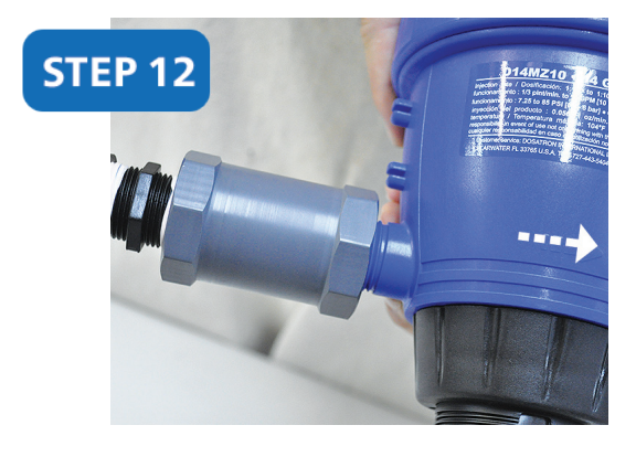
Pick up your inlet assembly and attach the flow restrictor end to the inlet side of the Dosatron. Note the direction of the arrow. Hand tighten.

Before installing the assemblies, thread the inlet and outlet of the Dosatron with thread seal tape .