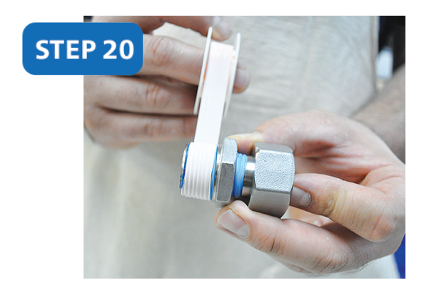
Wrap thread seal tape around the threads of the stainless steel hose adapter supplied with the cart.