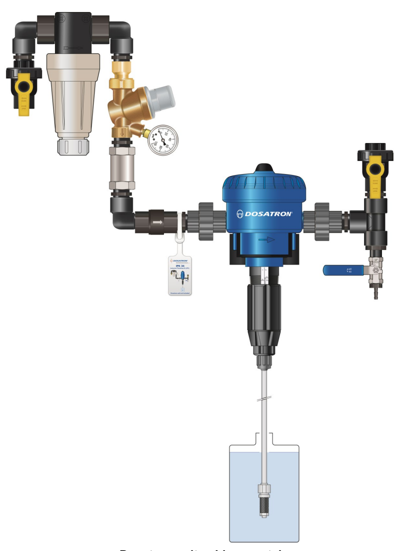
Dosatron unit sold separately.